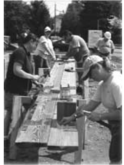
Employees of KMC Telecom work on the Roosevelt Avenue home during one of several company-sponsored workdays.