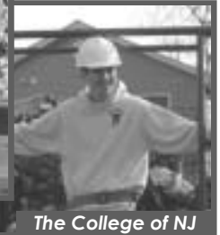
The College of NJ