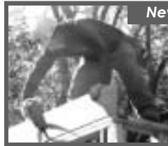
New Jersey Builders Assoc.