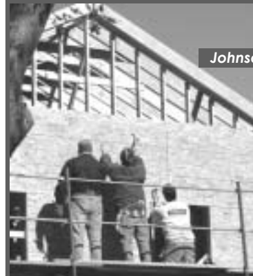
Johnson & Johnson

These are just a few of the organizations that have supported our building efforts by sponsoring workdays in Lambertville. Thank You!