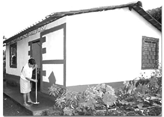
A finished home in El Salvador

Habitat for Humanity El Salvador serves families with very low incomes, mainly consisting of two minimum wages (US$288 monthly). On average, these families consist of five members who inhabit structures built of adobe without any treatment, bahareque (interwoven cane and mud), tin sheets, cardboard, wood, and plastic. To make matters