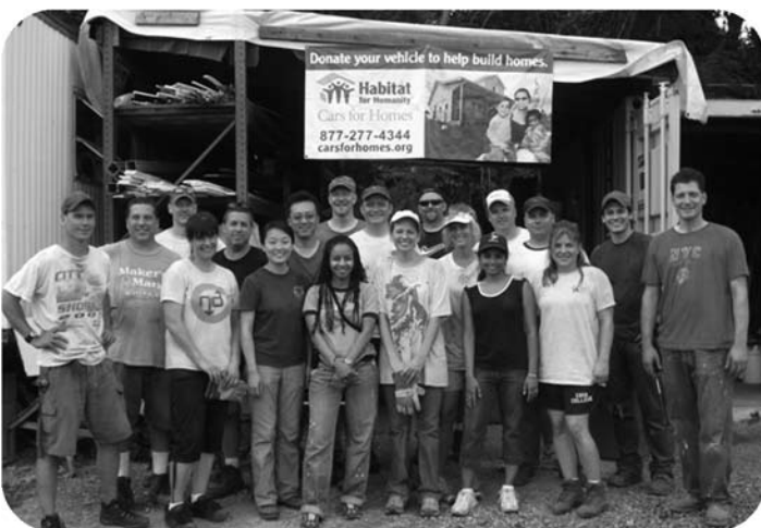
Merck employees pause for a photo on a hot July build day.