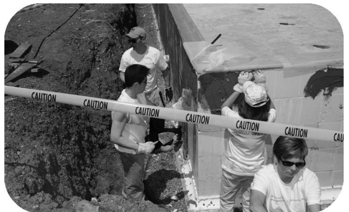
Ethicon employees work on the foundation of 7 Dutch Lane that is sponsored by the Johnson & Johnson family of companies. Team building the Habitat Way!