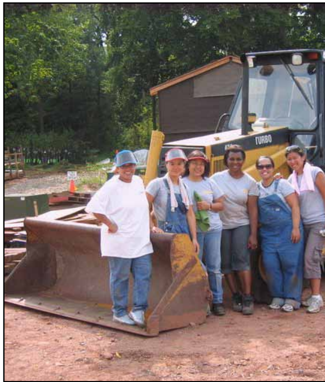
Learn a New Skill

“RVHFH is the kind of organization where every effort, every gift, no matter how small, has the potential to make a big and lasting impression on the lives of partner families, volunteers, donors, our community and the planet.”