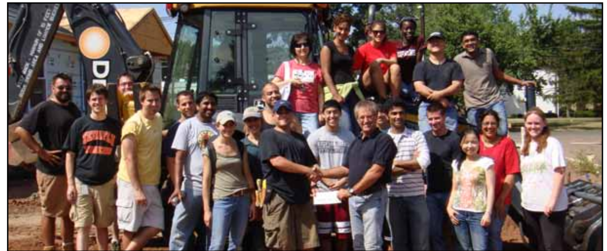
Make a New Friend