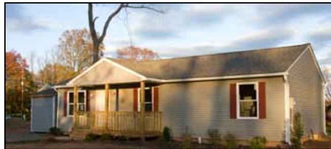
#5 Dutch Lane • Bridgewater, NJ