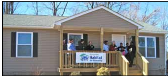
# 2 Dutch Lane • Bridgewater, NJ