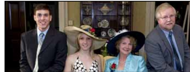
Habitat Derby Bash Hat Contest