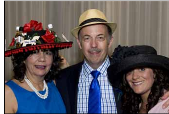
Habitat Derby Bash Hat Contest