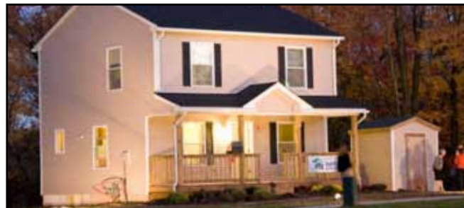
#7 Dutch Lane • Bridgewater, NJ